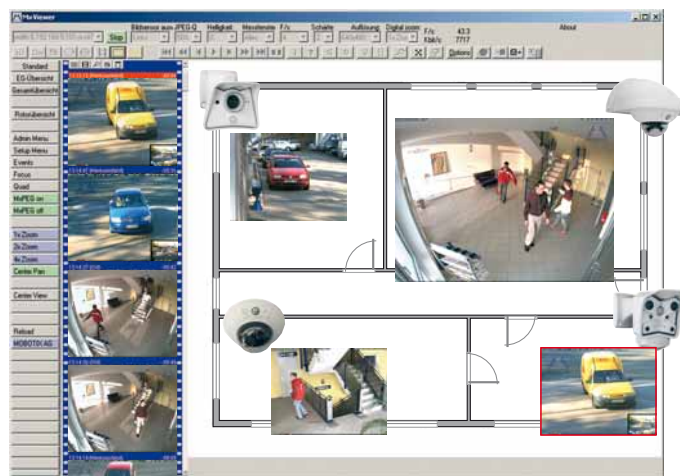
MxControlCenter alarm management software: free of charge with each camera - no restriction on camera type, layout editor or research functions

Developed and manufactured in Langmeil, Germany, MOBOTIX produces image-storing weatherproof highresolution cameras, including lens and wall/ceiling mountfor as little as 598 EUR ($798) excl. VAT. To date, more than 100,000 cameras have been sold worldwide.