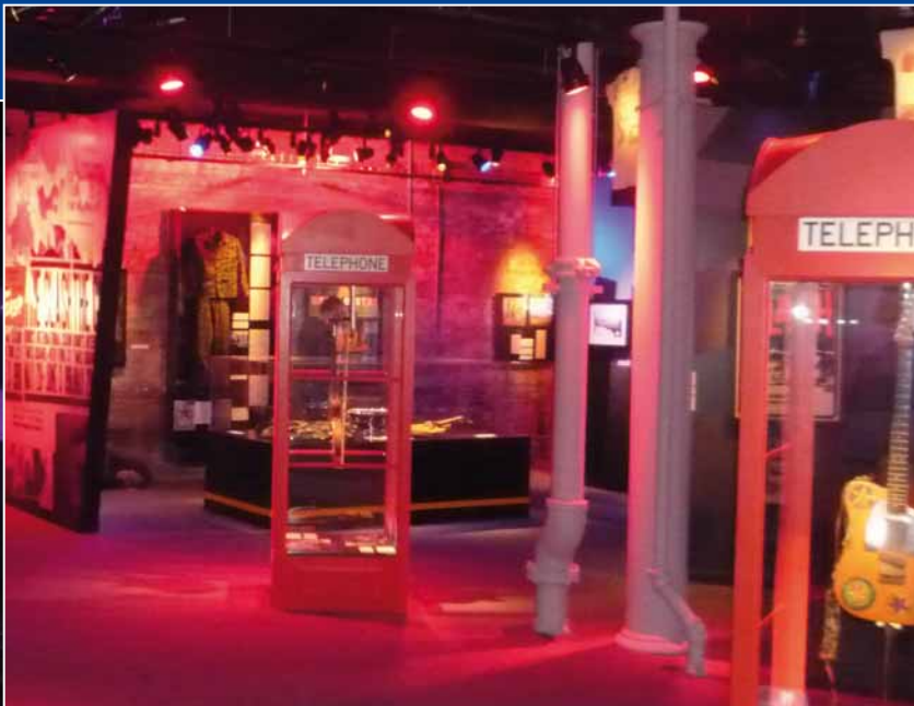
Cameras: 18x MOBOTIX DualDome , 13x MOBOTIX Hemispheric, 10x MOBOTIX Allround, 10x MOBOTIX MonoDome Storage: Overland Snap-Server 6100, Raid 5 with 40TB storage