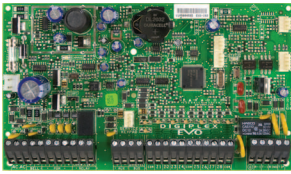
EVO192: 8 to 192-Zone Control Panel